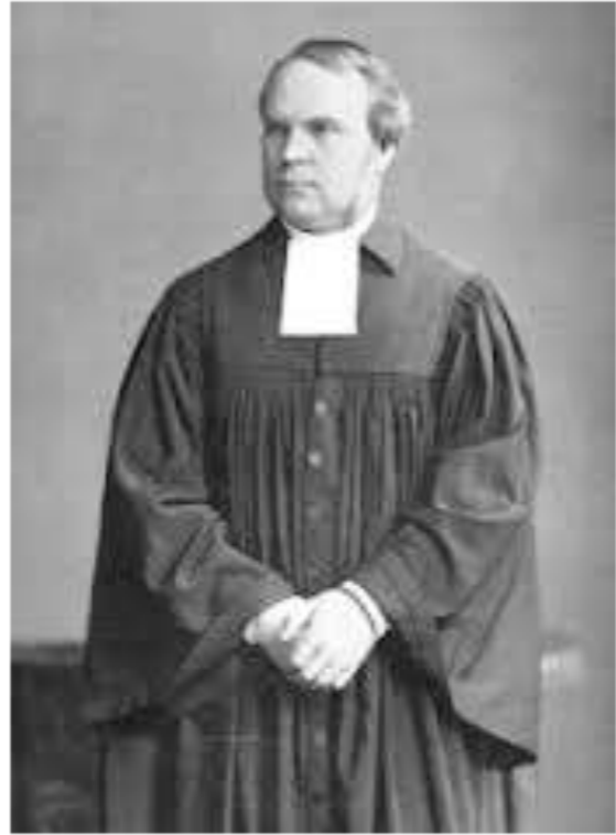
Adolf Stoecker (1835 – 1909)