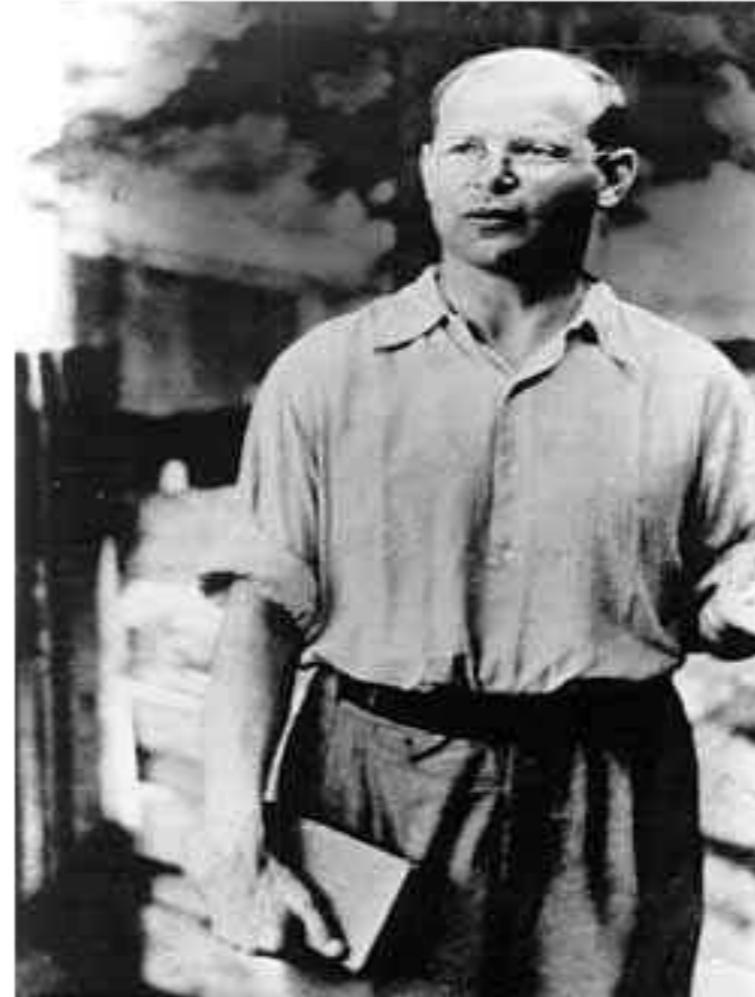
Pastor Dietrich Bonhoeffer (1906 –1945)