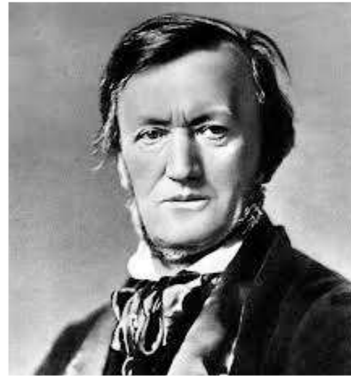
Wilhelm Richard Wagner (1813- 1883)