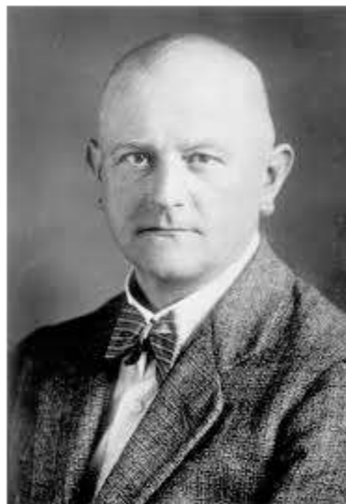
Ludwig Müller (1883 – 1945)