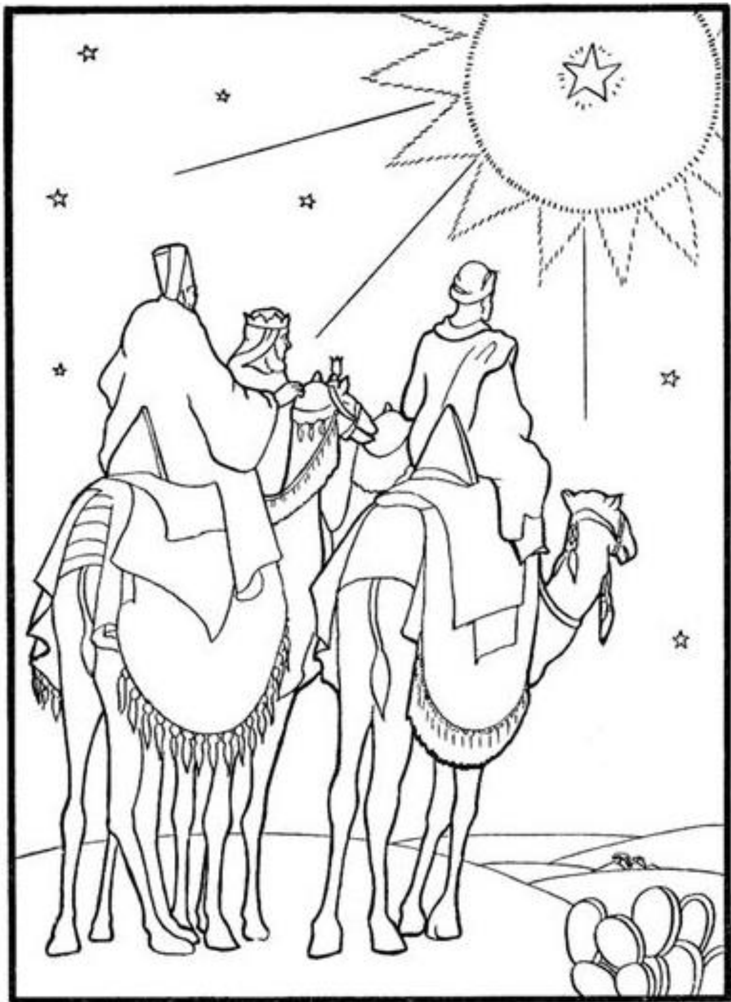
The Wise Men Followed the Star